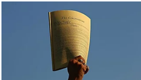
Why Congress is not serious about the war...