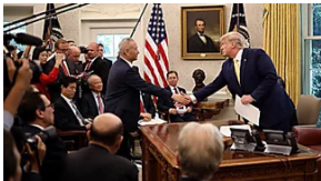
There's now a US-China trade deal — but what...

Second, NEPA directs agencies to share with the public the information they develop in assessing the environmental effects of their proposals, and especially with those most likely to be affected. This mandate serves to inform communities and catalyze the democratic process by soliciting input on important governmental choices.