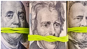
Read This Before You Renew Amazon Prime...