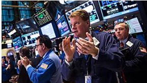
Desperate Democrats badmouth economy...